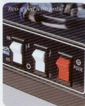
Two speed with pulse

A two year warranty provides protection that only the best can offer.